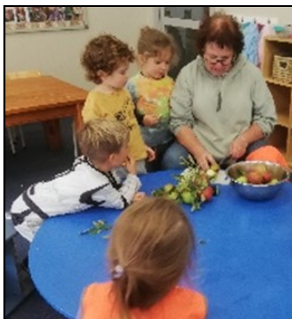
Eager to try kai from our garden

"He kai kei aku ringa- There is food at the end of my hands".