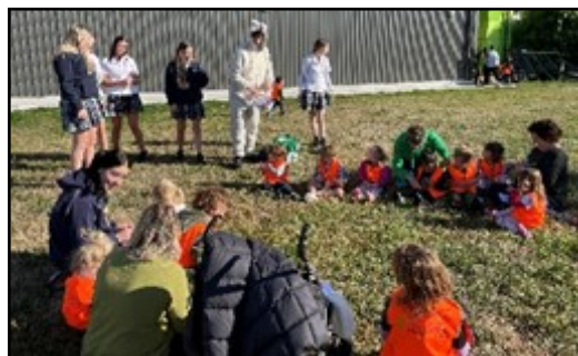
The Easter Bunny has arrived!

Gardening Life at Karanga Mai: The first few months of a new year is always an exciting time for us, as we get to enjoy the fruits of our labours from our māra. The value of seeing food develop in our garden and on our fruit trees provides such a rich learning opportunity. Many tamariki feel more willing to taste the food they have watched grow or helped cook themselves. It creates the opportunity to have conversations about where our food comes from and the nutritional value of natural unprocessed foods. For us this term, we were graced with an abundance of passionfruit, pears, apples, grapes and even peaches. So good too, to see our wider whānau being able to enjoy our Centre grown produce.