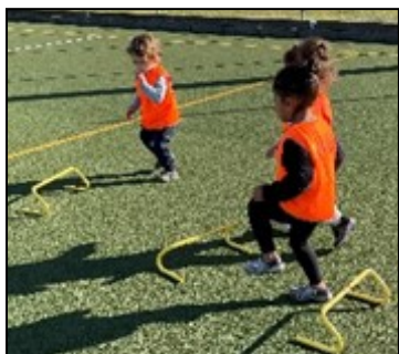
6-week activity programme