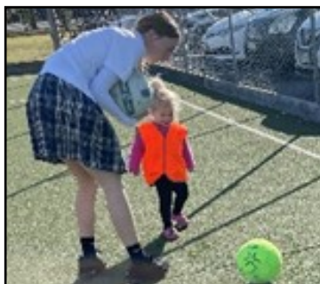
Fun with KHS Y12 Ākonga