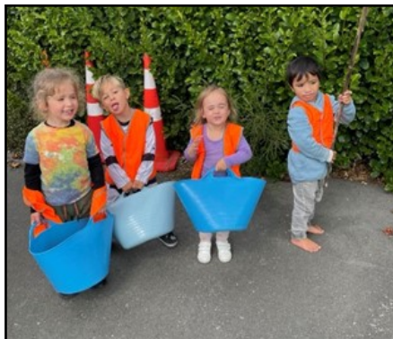
Gathering in the 'crops'